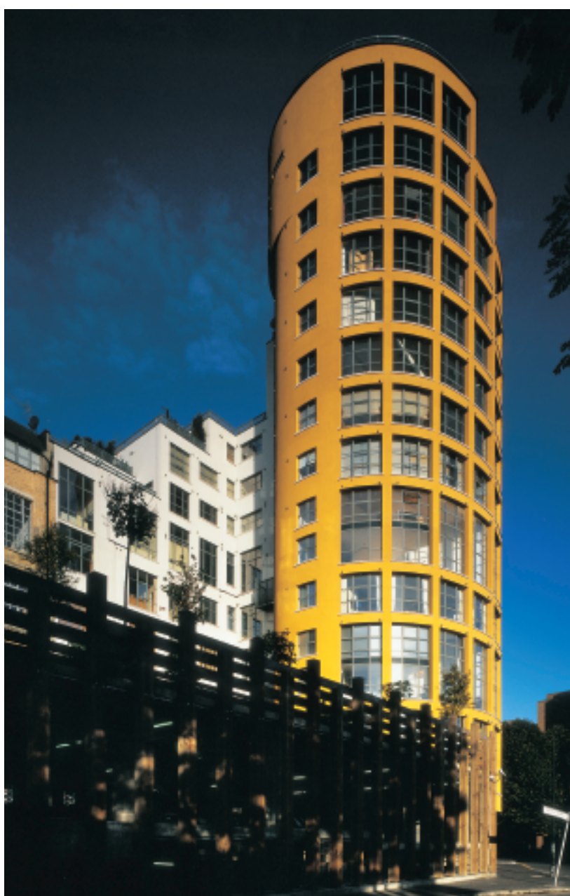
Bankside Lofts, London SE1 Architects: CZWG